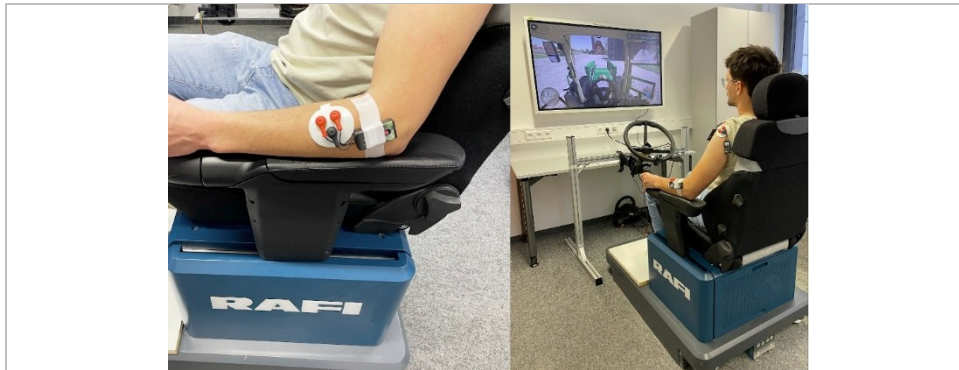
Figure 1: The RAFI simulator uses electromyography to measure muscular strain during steering wheel and joystick steering.

makes joystick steering a promising alternative for the future of agricultural technology.